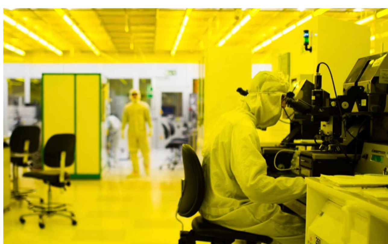
Smoltek R&D engineers in the MC2 laboratory

Patent 59: https://www.smoltek.com/post/smoltek-s-59th-patent-now-granted